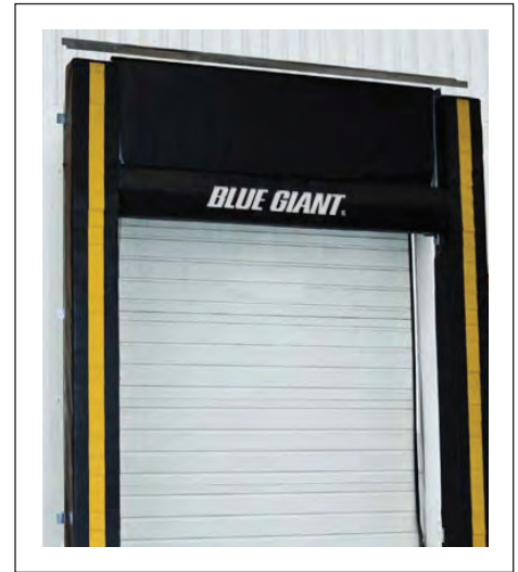
BGDSA Adjustable Head Pad Dock Seal